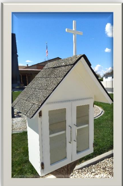
"Happiness is a Free Little Library"

"Have you seen the little white church on the post out in front? It's our Little Lending Library. We are looking for appropriate adult and children's books, new or used, to be placed in the little church. It appears that children's books are very popular and seem to be taken quickly. If you have any to donate please place in the bin in the church entry-way or feel free to drop them off at the office during the week. Let's encourage healthy family time and reading by enjoying good, uplifting books!